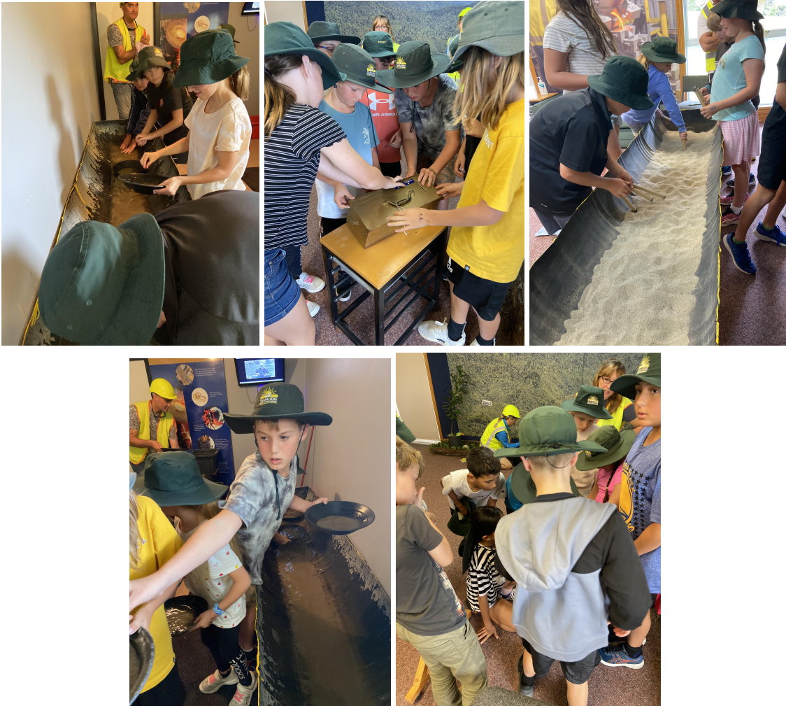
PUKEATUA POD ventured over to Waihi Beach this week, with a huge camp of 90 students! Here are some pictures of their adventures so far. We will share more in next week's newsletter.