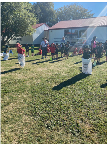
Together As One! Confident Can Do Kids! Honour Be Your Guide.