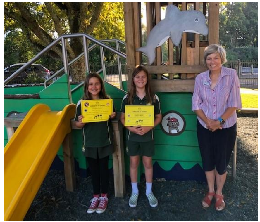
Together As One! Confident Can Do Kids! Honour Be Your Guide.