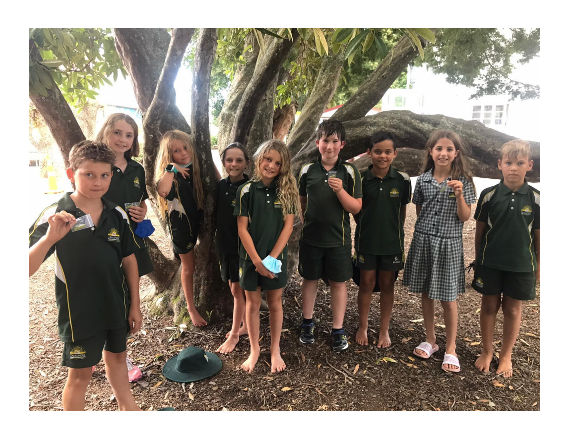
2022 ENVIRO MONITORS