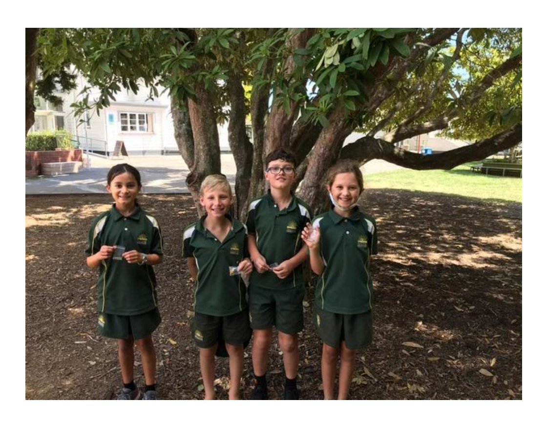
2022 SOUND SYSTEM MONITORS