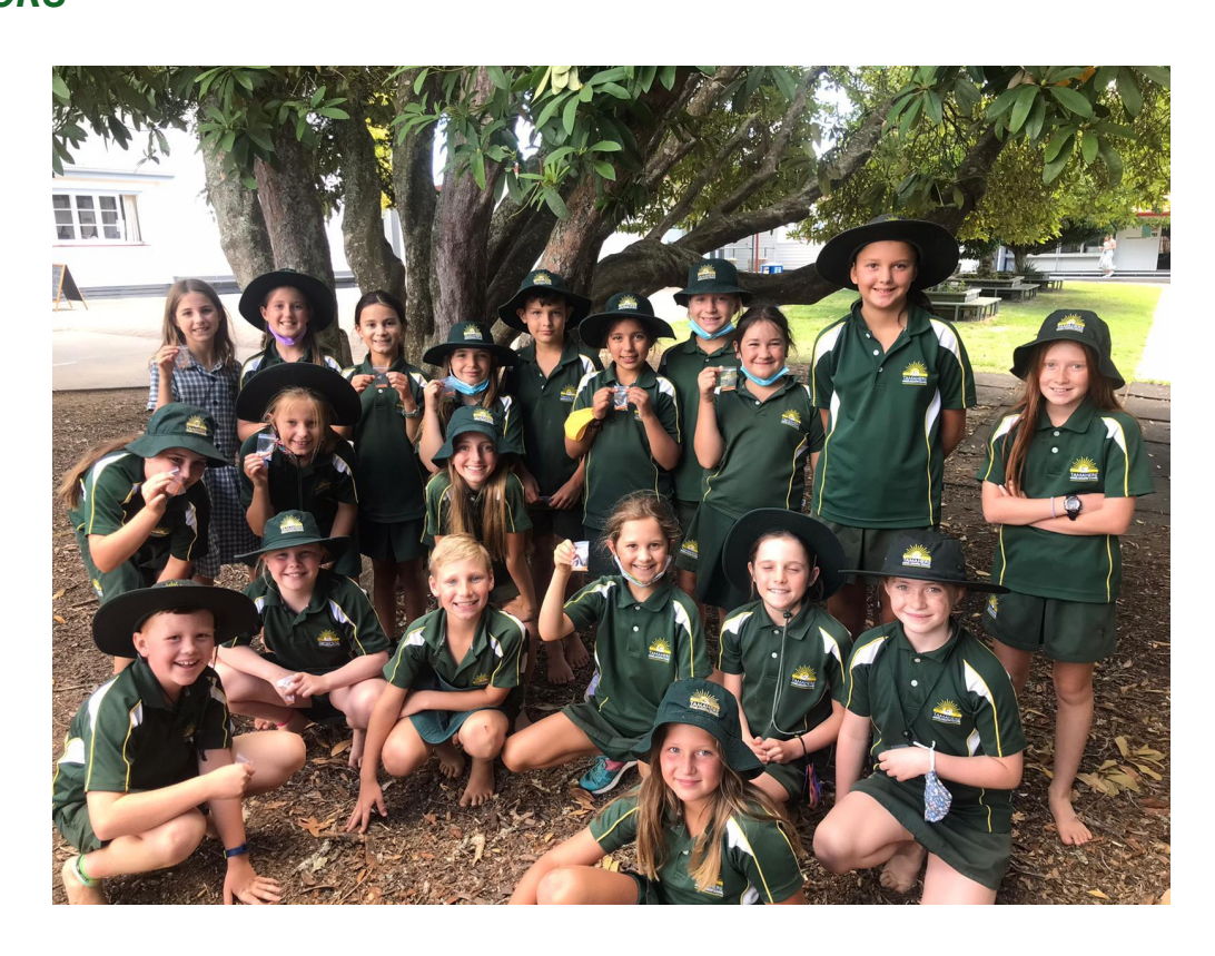
2022 ROAD PATROL MONITORS