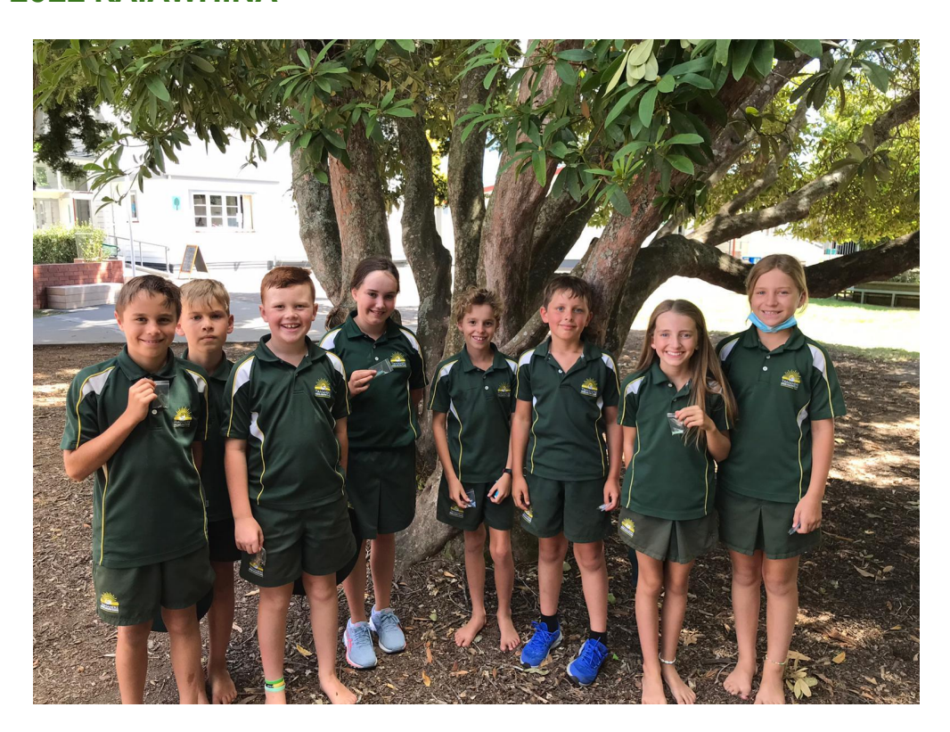
2022 PEER MEDIATORS