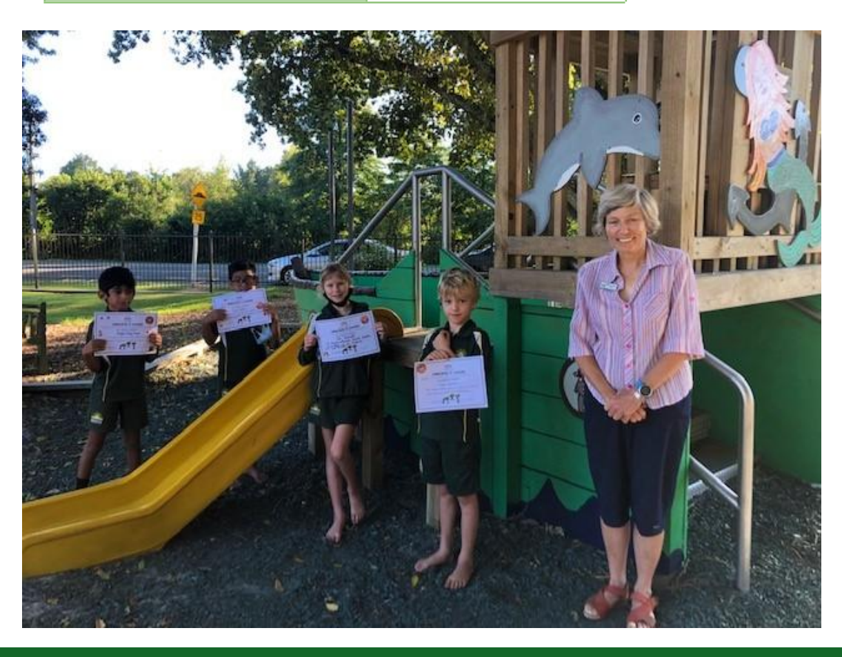
Together As One! Confident Can Do Kids! Honour Be Your Guide.