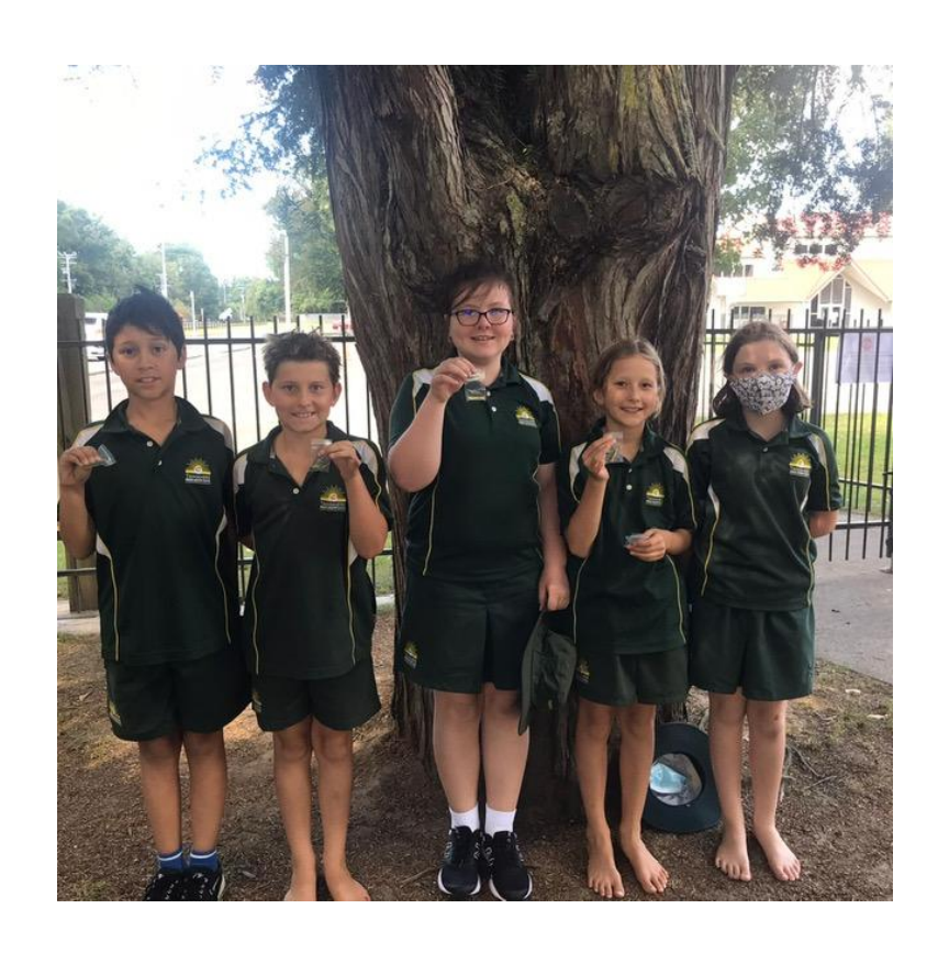
2022 BUS MONITORS