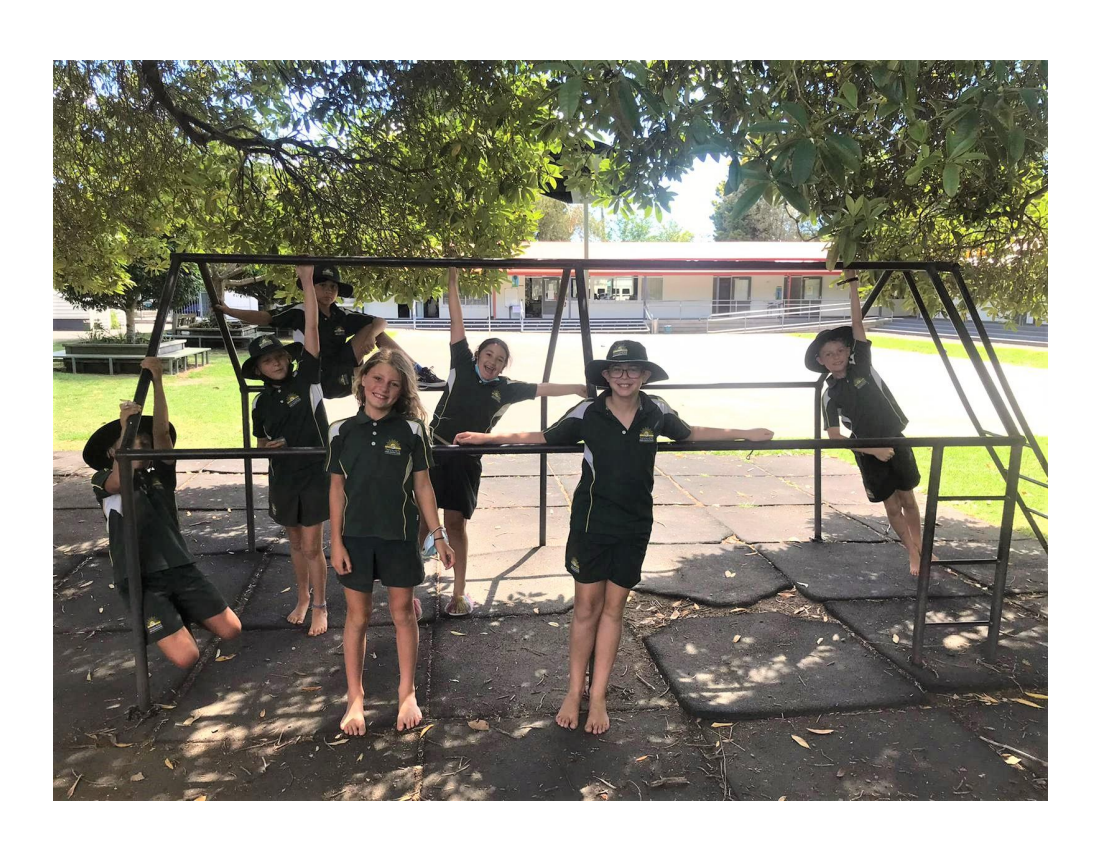
2022 ASC MONITORS