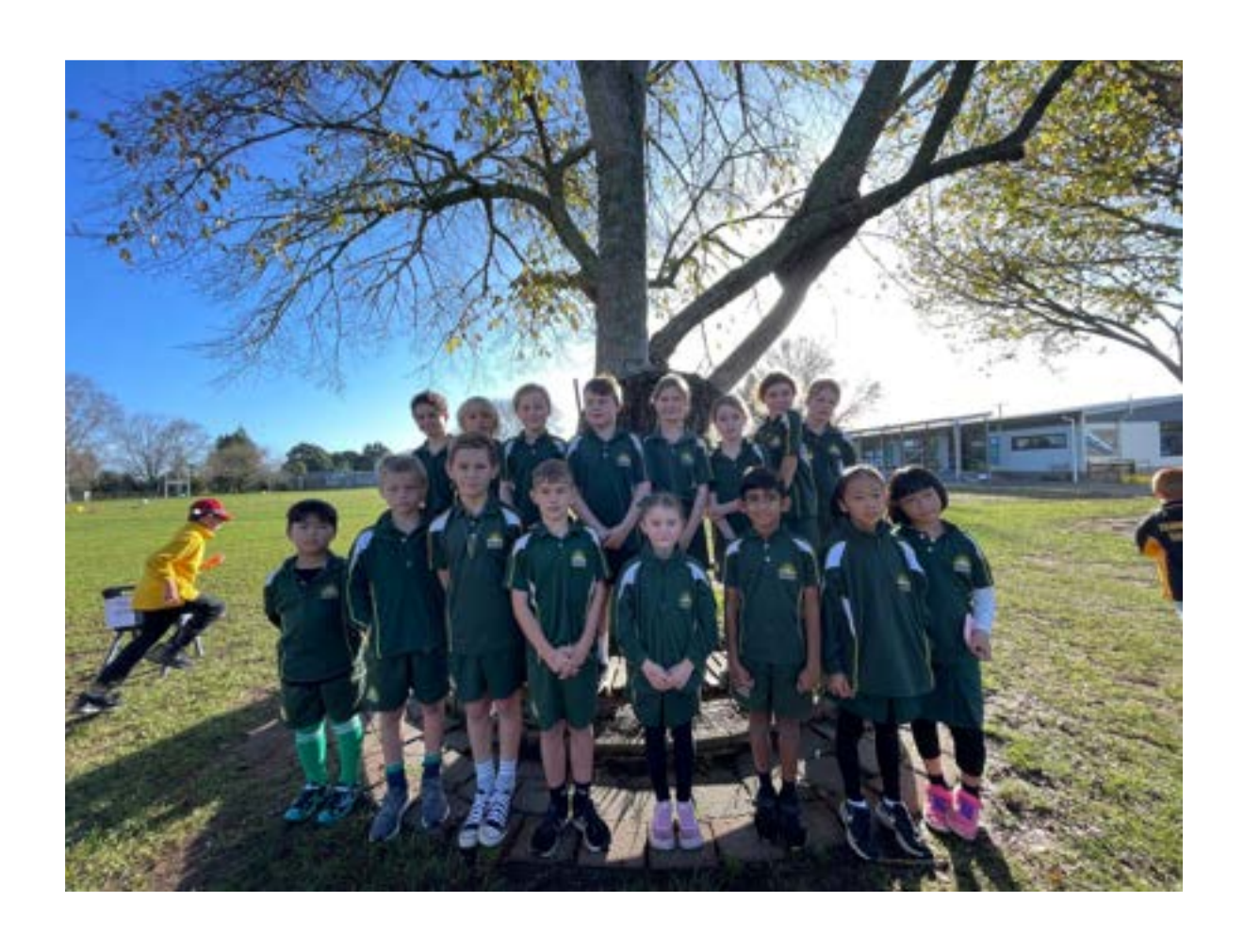
By Skip t.B and Thomas B

The weather was sunny and warm so it was a perfect day for us all.