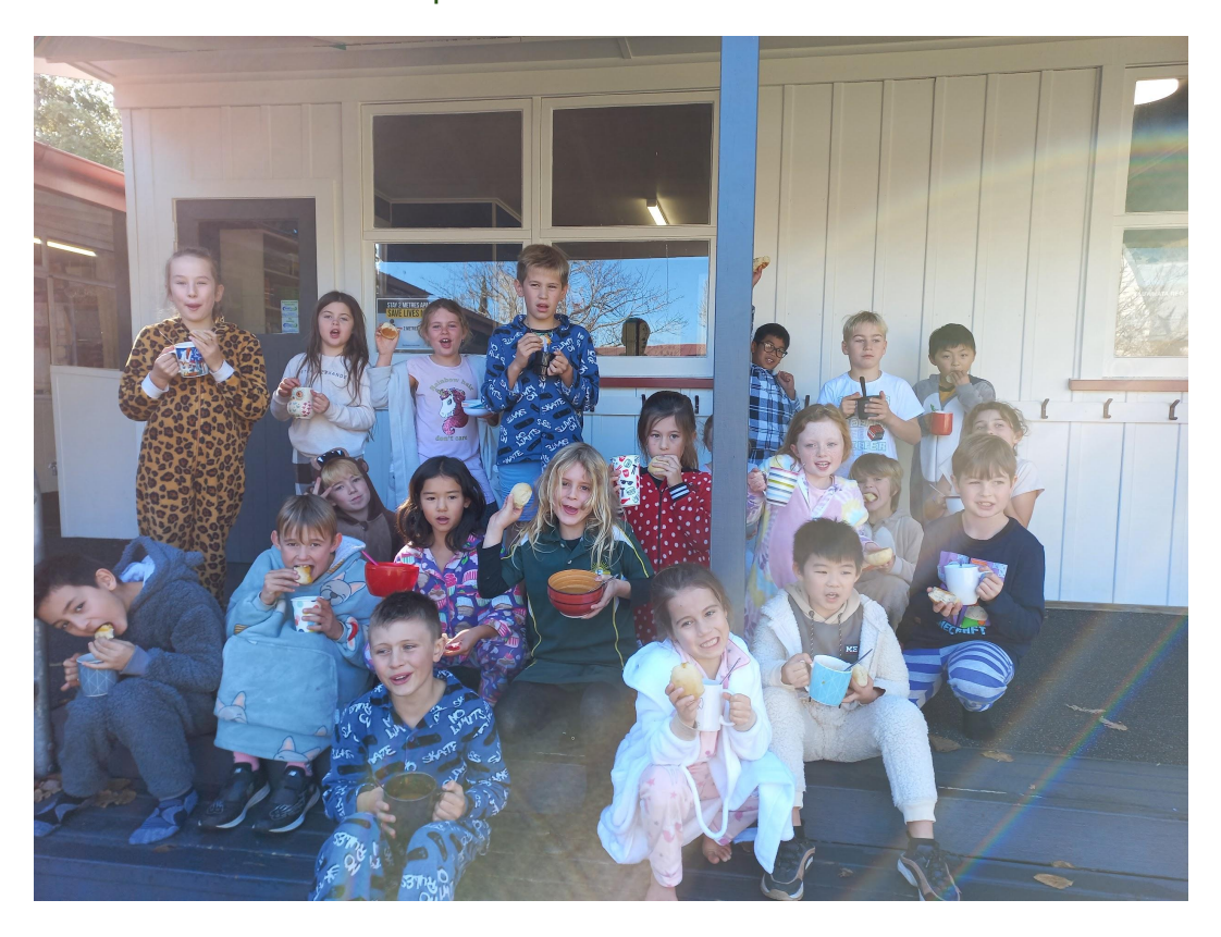
Together As One! Confident Can Do Kids! Honour Be Your Guide.

All the students in Pirongia thoroughly enjoyed Pyjama Day and making and sharing soup for Matariki. Thank you so much for all the generous donations of vegetables - the soup was delicious! It was neat to look out at lunchtime and see most of the syndicate sitting and enjoying kai together - that's what Matariki is all about! Tino pai tamariki!