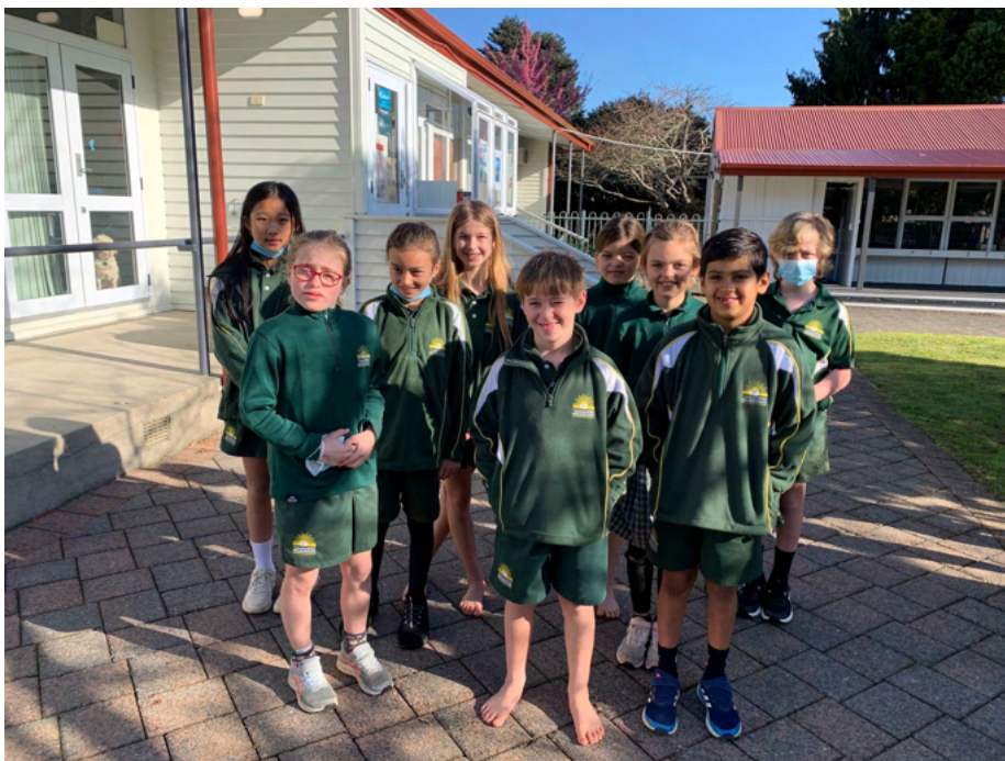
Absent from photo: Eliza F