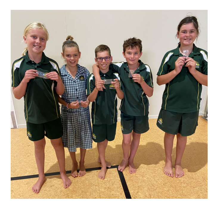
HOIHO WHĀNAU LEADERS