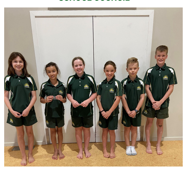
AFTER SCHOOL CARE MONITORS