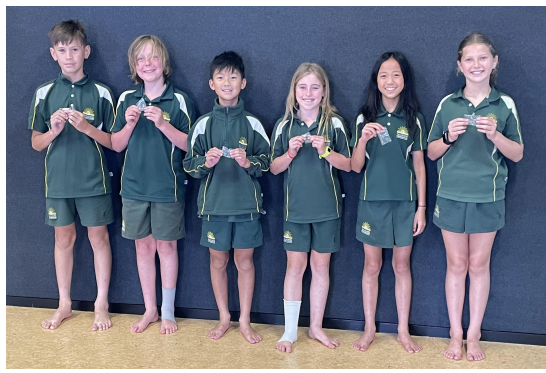
KOTUKU WHĀNAU LEADERS