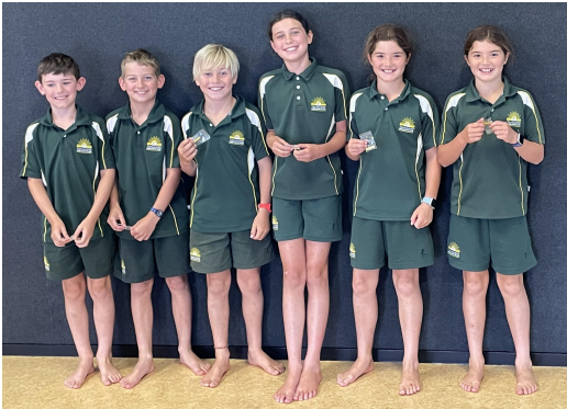
HOIHO WHĀNAU LEADERS