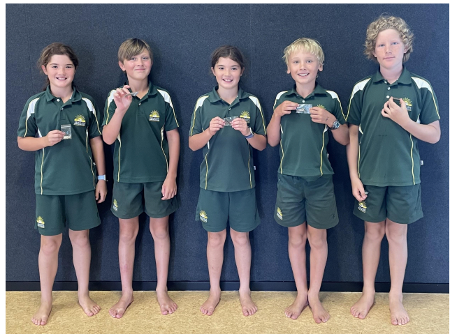
AFTER SCHOOL CARE MONITORS

Together As One! Confident Can Do Kids! Honour Be Your Guide.