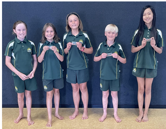
TAKAHE WHĀNAU LEADERS - Ryder S absent

Together As One! Confident Can Do Kids! Honour Be Your Guide.