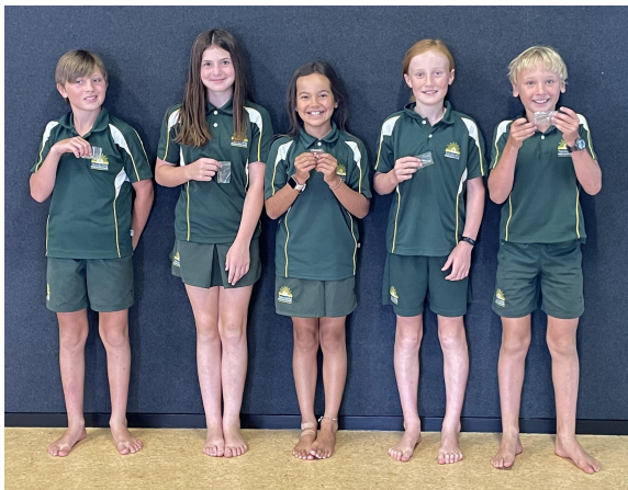
KAKAPO WHĀNAU LEADERS - Connor H absent