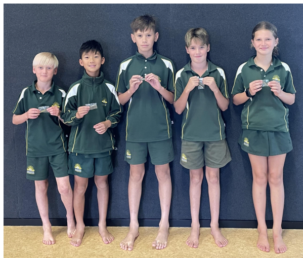
BUS MONITORS - Reed L absent

Together As One! Confident Can Do Kids! Honour Be Your Guide.