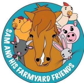
Mobile Farm Animal Visits samandhisfarmyardfriends.co.nz